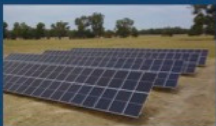
Ground Mount Solutions