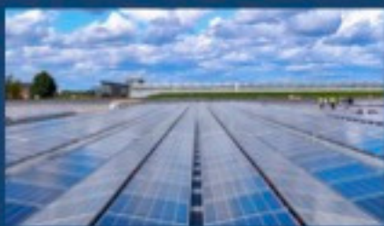
Roof Mounted Systems