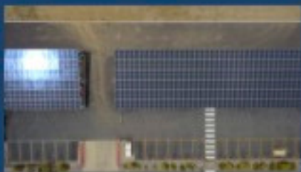
Multi Purpose Solutions

ABN 52 124 222 760 REC Licence: VIC 18083 / NSW 350319C / QLD 76899